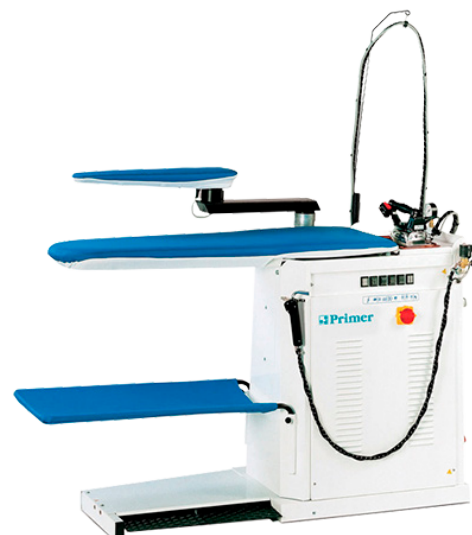
FRA-AVS + TROLLEY